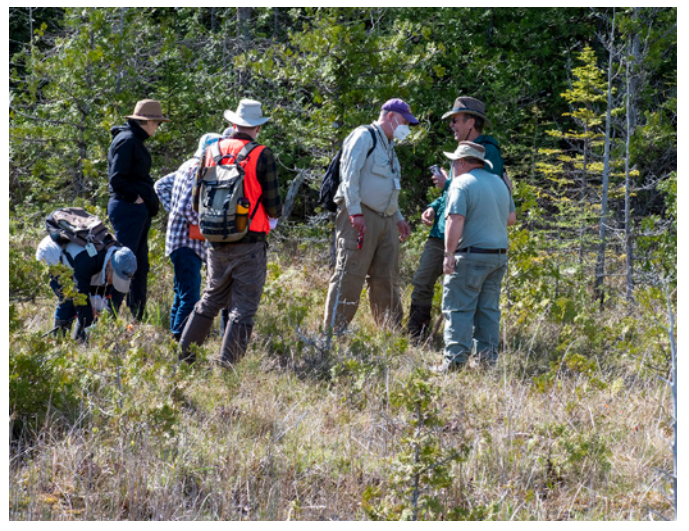
Thompson's Harbor