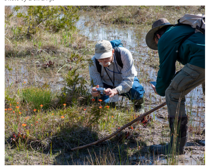
Thompson's Harbor Field Trip