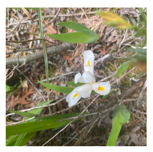
Iris lacustris, forma alba