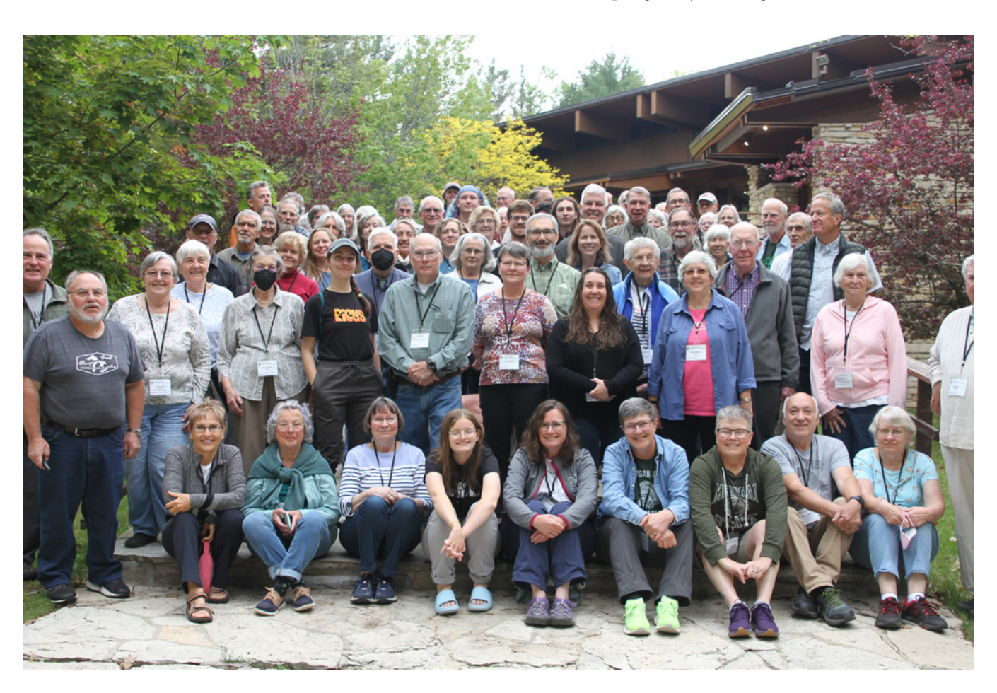
2022 Foray Attendees