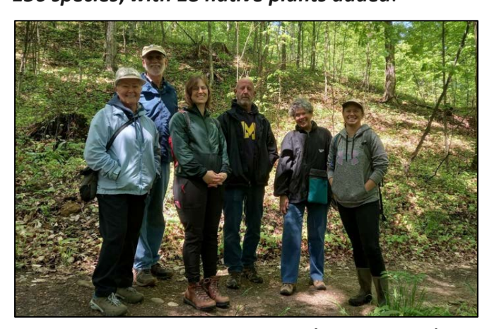
Hike attendees at Maplehurst. (Angie Bouma)

edge of a rich conifer swamp perched on the edge of a steep slope that flows into Torch Lake. From observations made by attendees and hike leaders, we increased the overall species list from 134 to 156 species, with 18 native plants added.