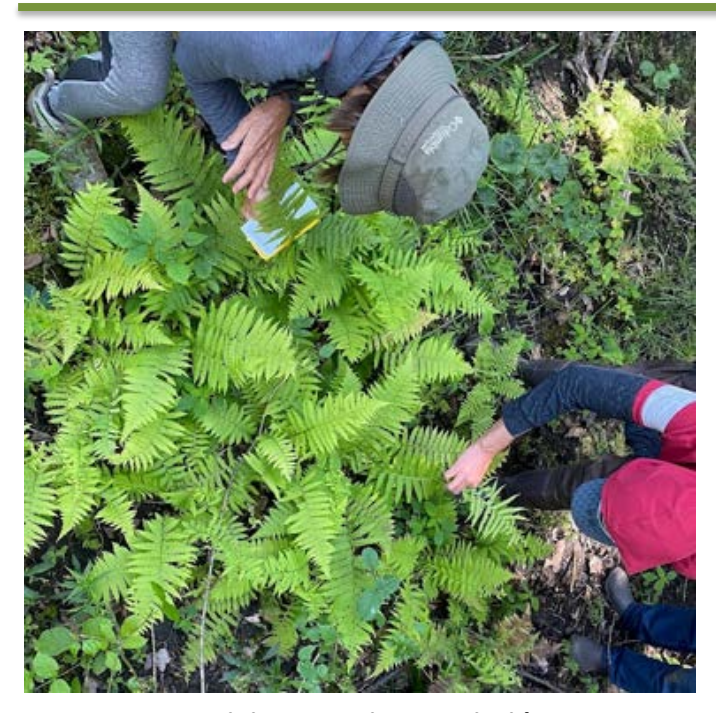
Examining Deparia acrosticoides.

If you'd like to visit Hatlem Creek Preserve in the future, you should also check out the impressive kettle holes in the end moraine off of Echo Valley Road, just a half-mile to the west. This is owned by Sleeping Bear Dunes National Lakeshore, and although there are no trails, you can spot the kettles on a topo map. The rich mesic northern