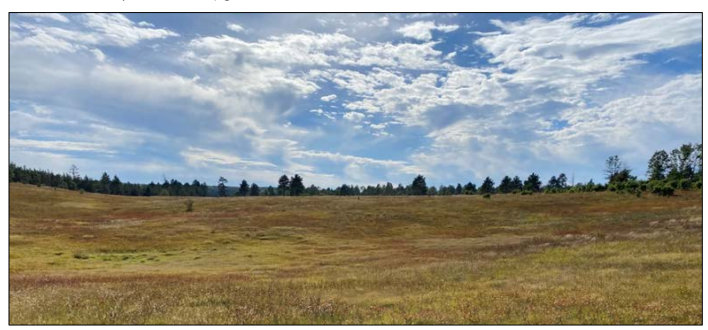
Sand prairie at Markle and Meridian Rds., Oscoda County.