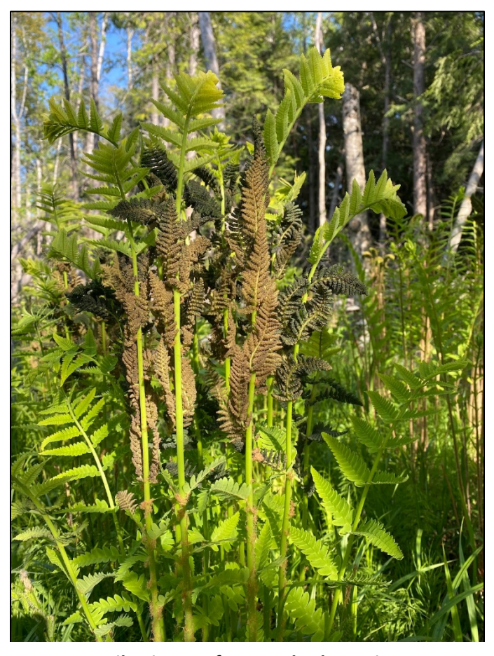
Fertile pinnae of Osmunda claytoniana.

Devonian eras. Many of our species today are relatively "young," diversifying in the late Cretaceous after the arrival of angiosperms, but some are relatively unchanged. Lycophytes (clubmosses, quillworts, and spikemosses) have the oldest fossil record of any surviving plant lineage, with some extant species sharing traits with some of these early fossils. Interrupted fern (Osmunda claytoniana) appears in the fossil record in the upper Triassic, appearing unchanged for over 200 million years!