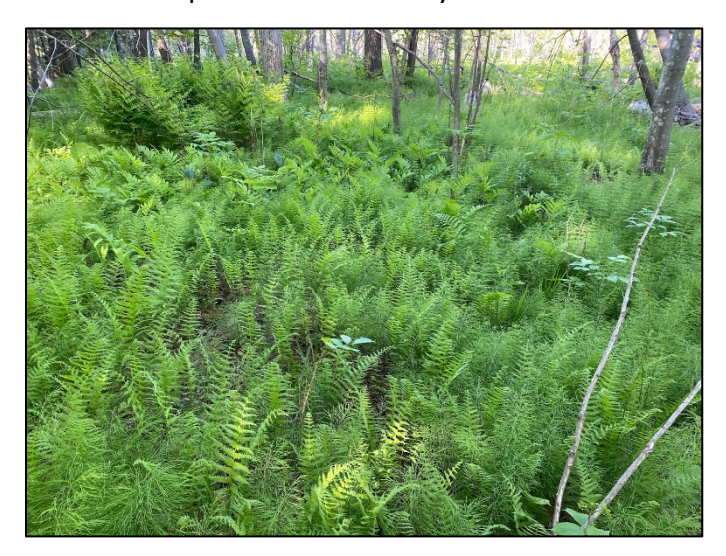
New York Fern with woodland horsetail, sensitive fern, and royal fern.

color, and identify different shapes and arrangement of sori, which can be helpful in constructing a "mental map" of fern taxonomy.