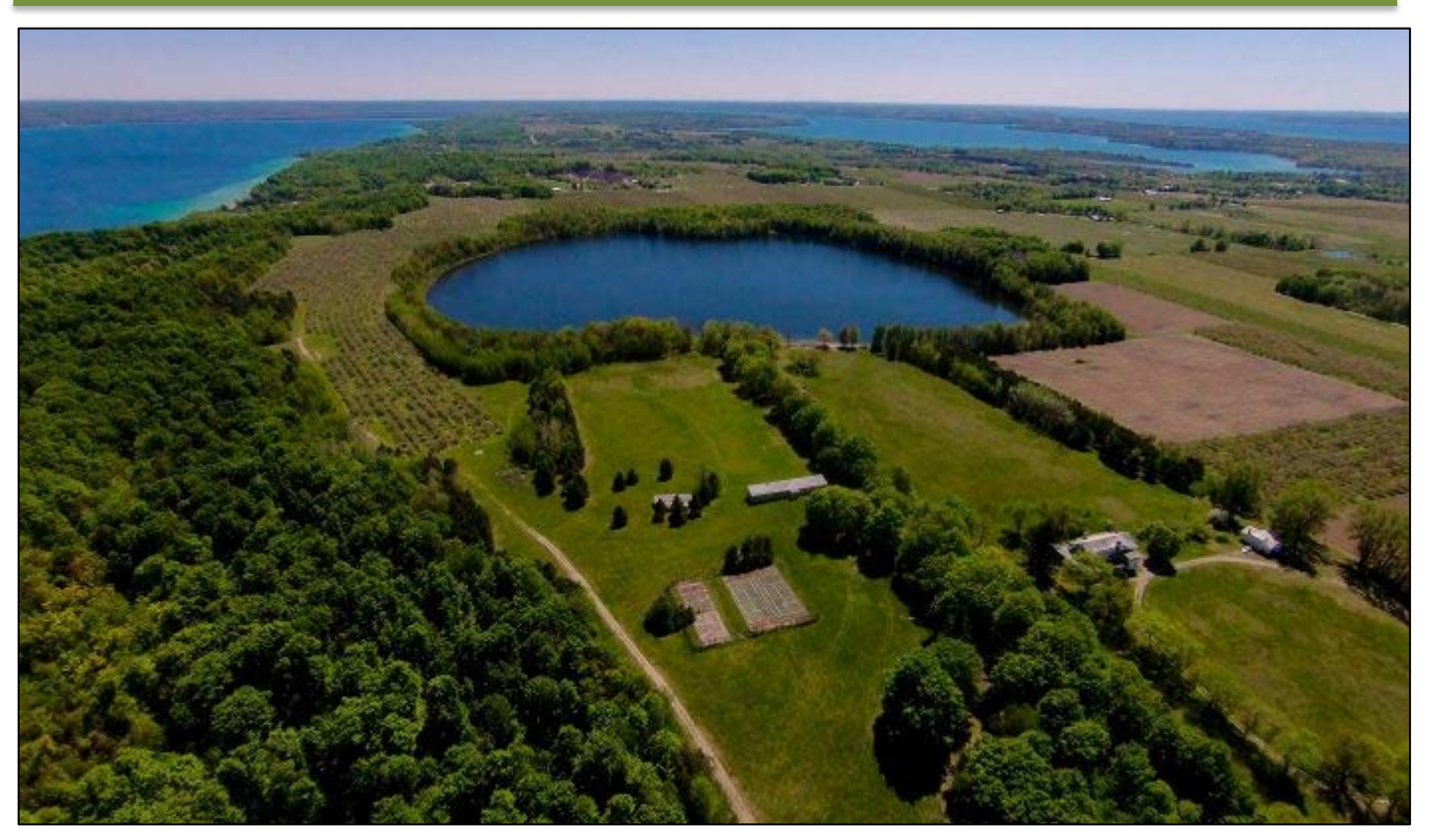
Aerial image of Lake Maplehurst at Maplehurst Natural Area.

Maplehurst Natural Area is owned by Milton Township and was home to the beloved Camp Maplehurst from 1955 to 2011. It has 150 acres of steep hardwood forested bluffs that drain into Torch Lake, and open meadows that surround Lake Maplehurst, which is a 60-acre spring-fed