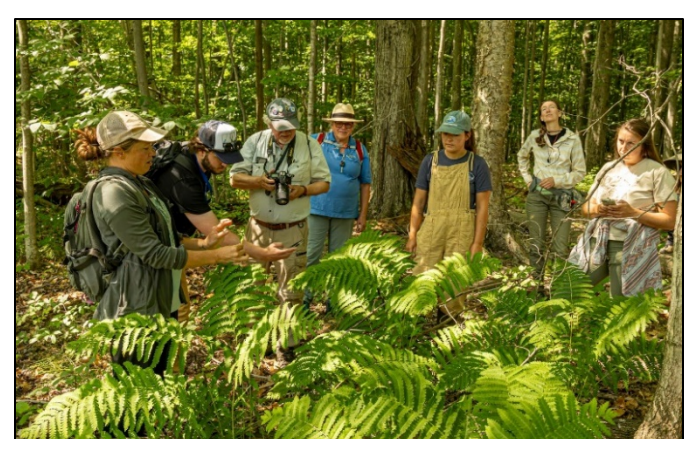
Thinking about cinnamon ferns.

Highlights included silvery spleenwort (Deparia acrostichoides), New York fern (Thelypteris (Amauropelta) noveboracensis), and a regal show of ferns in the family Osmundaceae: cinnamon fern (Osmundastrum cinnamomeum), interrupted fern (Osmunda claytoniana), and royal fern (Osmunda regalis). One of my favorite pteridophytes, woodland horsetail (Equisetum sylvaticum), covers a delightful couple of acres around a meandering stream. We also examined a few lycophytes, including tree-clubmoss (Dendrolycopodium obscurum) and stiff clubmoss (Spinulum annotinum). Last but not least, we caught the Michigan monkey-flower in bloom.