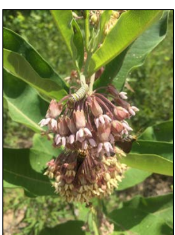
Time sequence of common milkweed visitors (Liana N. May)