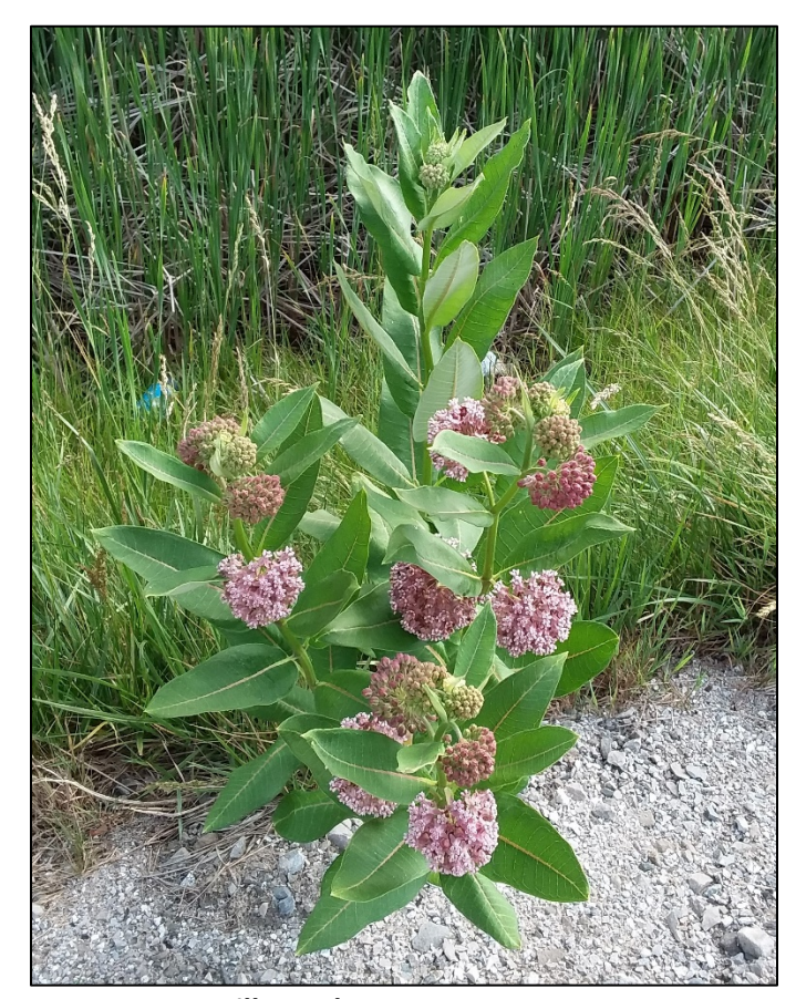
Common milkweed (Scott Warner, Botanist, MNFI)

In Michigan, there are 11 native milkweed species; common milkweed (Asclepias syriaca) and butterfly-weed (Asclepias tuberosa) are perhaps the most well-known. The one and only obligate wetland species, swamp milkweed (Asclepias incarnata), is also fairly common. Less common are species like poke milkweed (Asclepias exaltata), which is the only milkweed in Michigan that can grow in shaded forest understories. The remaining milkweed species generally prefer various habitat types that are open, sunny, and have well-drained soils. Some, like green milkweed (Asclepias viridiflora), can tolerate harsh conditions of dune habitats where temperatures in the summer can reach 150 degrees thanks to reflective "hairs" on its leaves, which help the leaves retain water and reflect heat.