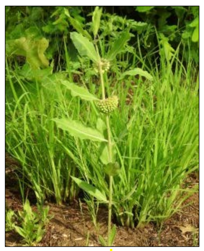
Green milkweed (R. Schipper)

ascertain what level of stewardship they may need in the future. Removal of the pernicious and invasive babies' breath ( Gypsophila paniculata ) is an ongoing task at many nature preserves and maintaining intact habitats benefits milkweeds and insect species that rely upon them.