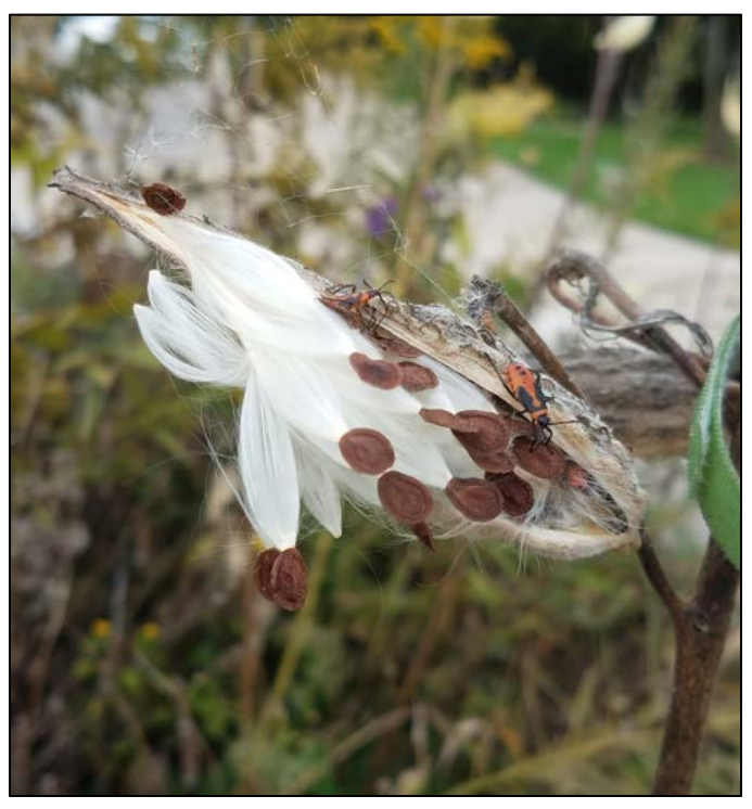
Common milkweed (P. Higman)

With the upcoming winter season well on its way, it is time to bid farewell to the last of the milkweed seeds as they drift loose from their pods into the sky and share some fun facts about these unique plants with flowers that some posit are second in complexity only to the orchids.