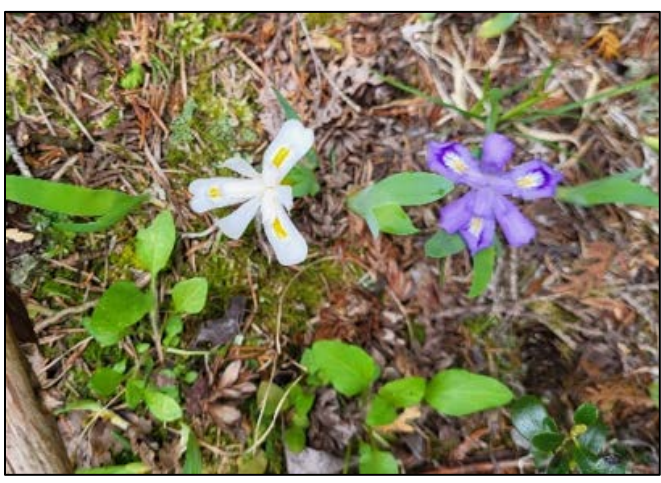
Iris lacustris forma alba relocated on May 18, 2022, at a 1994 collection site in Thompson's Harbor SP.

-Story, photo submitted by Rachel A. Hackett, MNFI