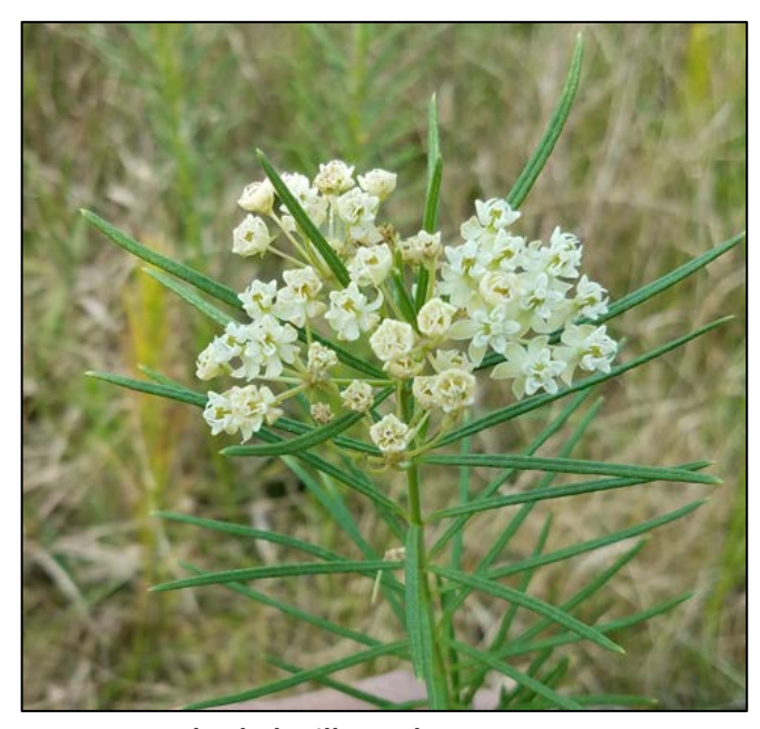
Whorled milkweed (P. Higman)