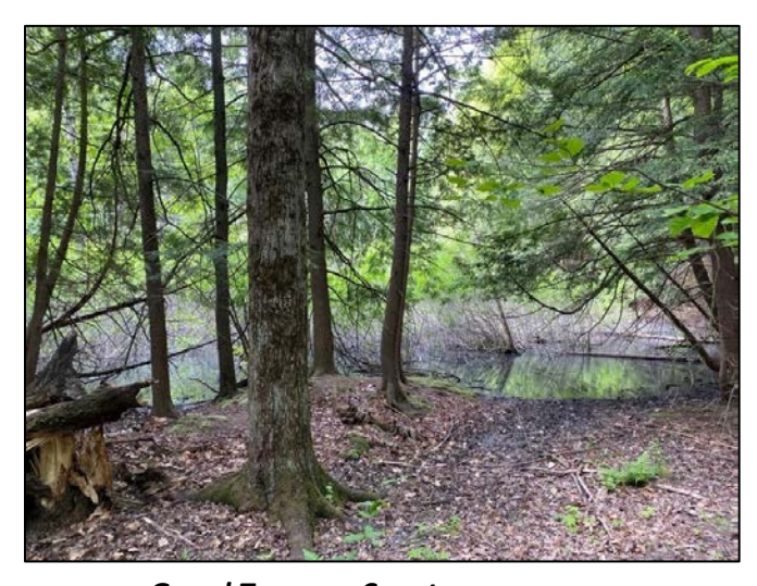
Excursion at South Long Lake Forest Conservancy, Grand Traverse County

https://www.gtrlc.org/recreationevents/preserve/south-long-lake-forest/