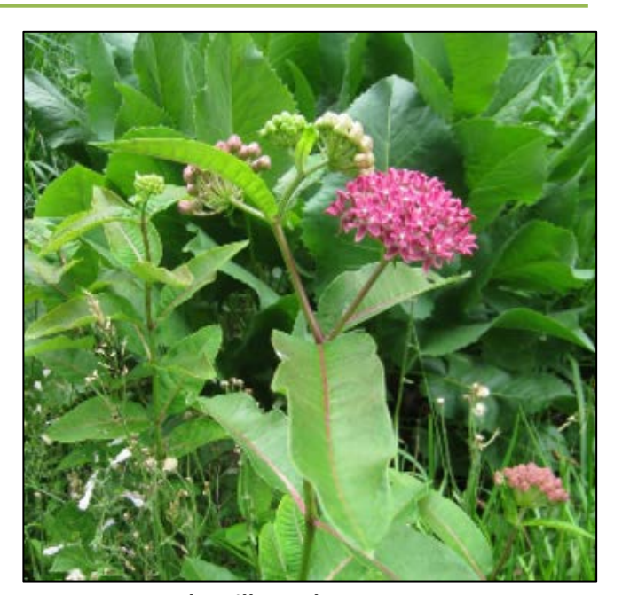
Purple milkweed (B. S. Walters)