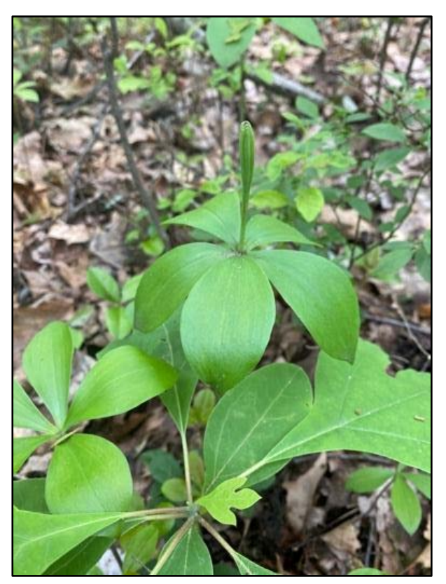
Whorled pogonia with fruit in a sandy, seasonally wet red oak-red maple stand in Saginaw County 6/9/22.

imperiled." There is hope that we can continue to document new populations of whorled pogonia in Michigan, so keep your eyes out for them on acidic soils (they like a pH of 4.5-5!) in tamarack bogs and sandy red maple stands next June.