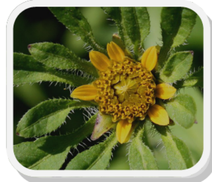
A jewel among the spines - big devil beggar-ticks, Bidens vulgata