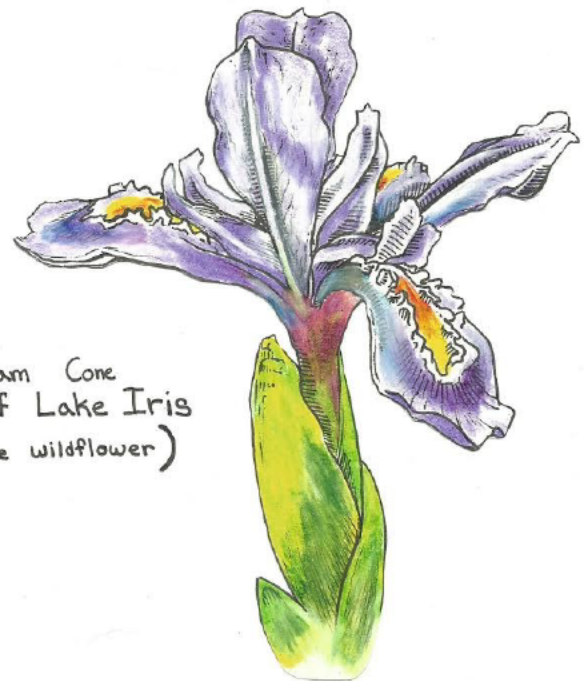
Abraham Cone Dwarf Lake Iris (State wildflower)

“Hidden Lake Gardens began as a simple testament to the education and enjoyment of the public. The Gardens are a natural paradise, a place to escape from everyday life and connect with the world of nature. The bonsai courtyard displays miniature trees as works of art. Rare and exotic plants thrive in the arid, tropical, and temperate conservatory settings. Annuals and perennials offer bright blooms in the sun and soothing foliage in shade. Trees and shrubs across acres and acres of rolling terrain demonstrate their natural and ornamental attributes. From the comfort of a car or on meandering footpaths, visitors have at their disposal a visual treat, ranging from the modest to the magnificent. Every season offers new highlights, views, and adventures. Come and experience this beautiful botanical garden and arboretum in the scenic Irish Hills of southeast Michigan.”