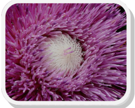
A nod to a thistle - Carduus cernuus