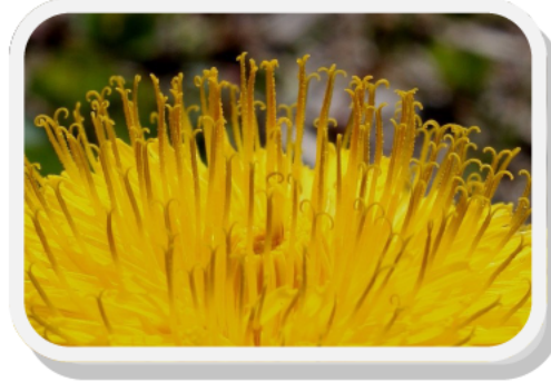
Even dandelions can be new - Red- seed dandelion, Taraxacum erythrospermum