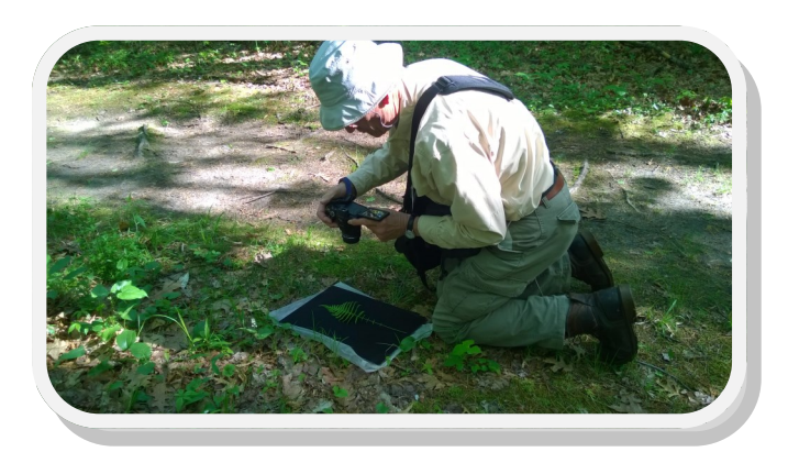
Spring Foray: Photographing