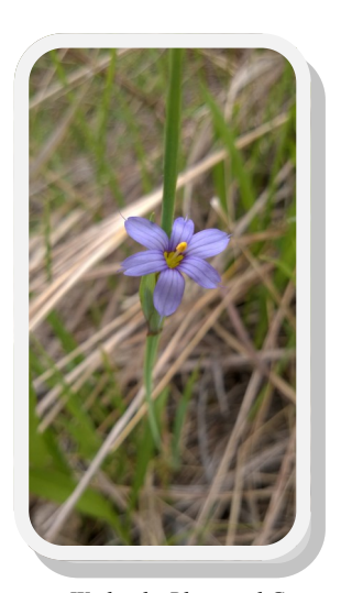
Saginaw Wetlands, Blue-eyed Grass, Sisyrinchium albidum.